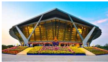
MAHIDOL UNIVERSITY, BANGKOK, THAILAND