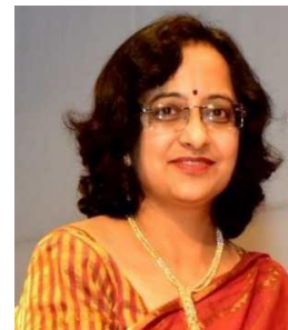
MBBS, MD, DNB (MCH), MNAMS

I am delighted to write about the International Institute of Health Management Research (IIHMR), Delhi, which has emerged as an institute of repute, both nationally and globally, for producing competent, socially conscious, and vibrant healthcare management professionals. Our top-ranked and innovative Postgraduate Program, with specializations in Health Management, Hospital Management, and Health Information Technology Management, is well recognized in the country as it meets the existing demands and challenges of the healthcare sector, as evident from our NAAC 'A' accreditation. The institute has carved out a niche for itself through its cutting-edge curriculum, excellent infrastructure, and accomplished multi-disciplinary faculty.