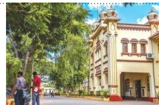
UNIVERSITY OF JAFFNA, SRI LANKA